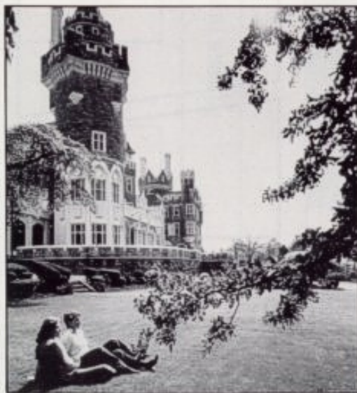
Students relax on the quad in front of Edwards Hall, one of the architectural gems of G.U.E. Tech. The campus spans a century in building design, ranging from the Victorian opulence of Edwards Hall to the reflective glass facade of the Nutrition Building.

Although you'll be spending most of your time studying, it's important to remember that life exists outside of your textbooks and your computer screen. Take an afternoon to visit the Museum of Contemporary Art or the Loeffler Aquarium. Join the Freshman Drama Group or the Hellenic Club. Write a weekly column for the G.U.E. GNEWS. Take advantage of the Athletic Complex, whose weekly paddleball tournaments draw a lively crowd.