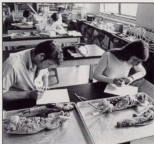
Biology students delve into the mysteries of the digestive system. This popular course makes full use of G.U.E.'s modern laboratory facilities.

Another way to broaden your college life is to take a class entirely unrelated to your distribution requirements or your major. The "Zinc As Life Force" Seminar in the Department of Alchemy is but one of the many unusual courses you'll find in your catalog.