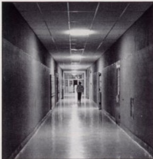
The Infinite Corridor connecting the Aeronautics and Chemistry buildings seems to stretch into infinity. It will soon become as familiar to you as your dorm room.

Large, underground tunnels connect most of the buildings. However, many of these tunnels are very old, and a number have been closed for safety reasons. While you may be tempted to explore, DON'T risk it. Several deaths have been attributed to student explorations in the tunnels. Closed tunnels are off-limits; they're closed for a reason, and we encourage students to restrain their curiosity and keep out of them.